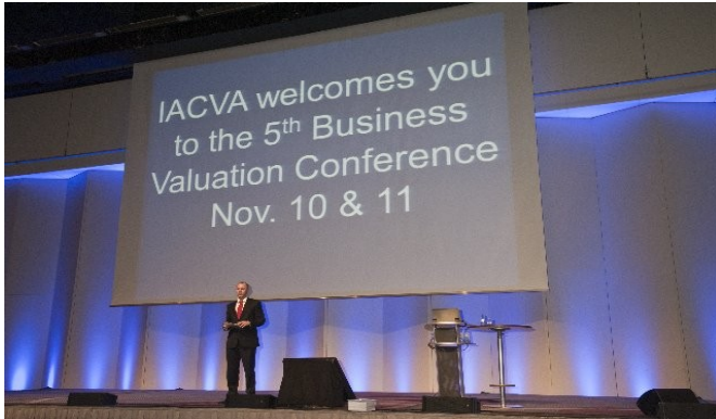
▲ The Opening Ceremony

IACVA-Europe's Fifth Annual Business Valuation Conference 2011 "Valuation Excellence" took place on November 10 & 11 in Dusseldorf, Germany. It was followed by IACVA's World Council Meeting on November 12. Both events were very successful, with over 250 attendees from Europe, North America, Africa, the Middle East and other parts of the world.