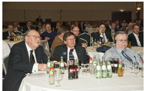
▲ IACVA leaders and other participants

Please contact your Charter to follow-up on any of these items that is of interest to you.